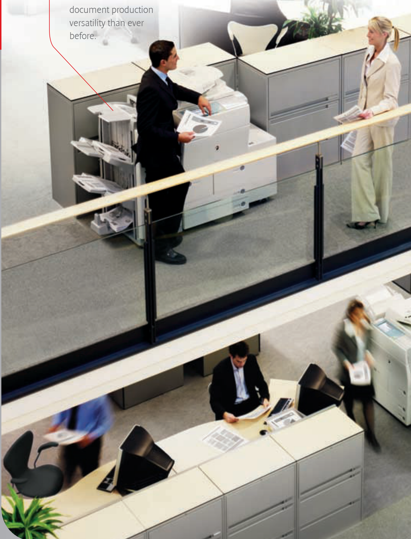
Black and white intelligence that supports you in the office

The iR 5570/6570 devices offer more document production versatility than ever before.